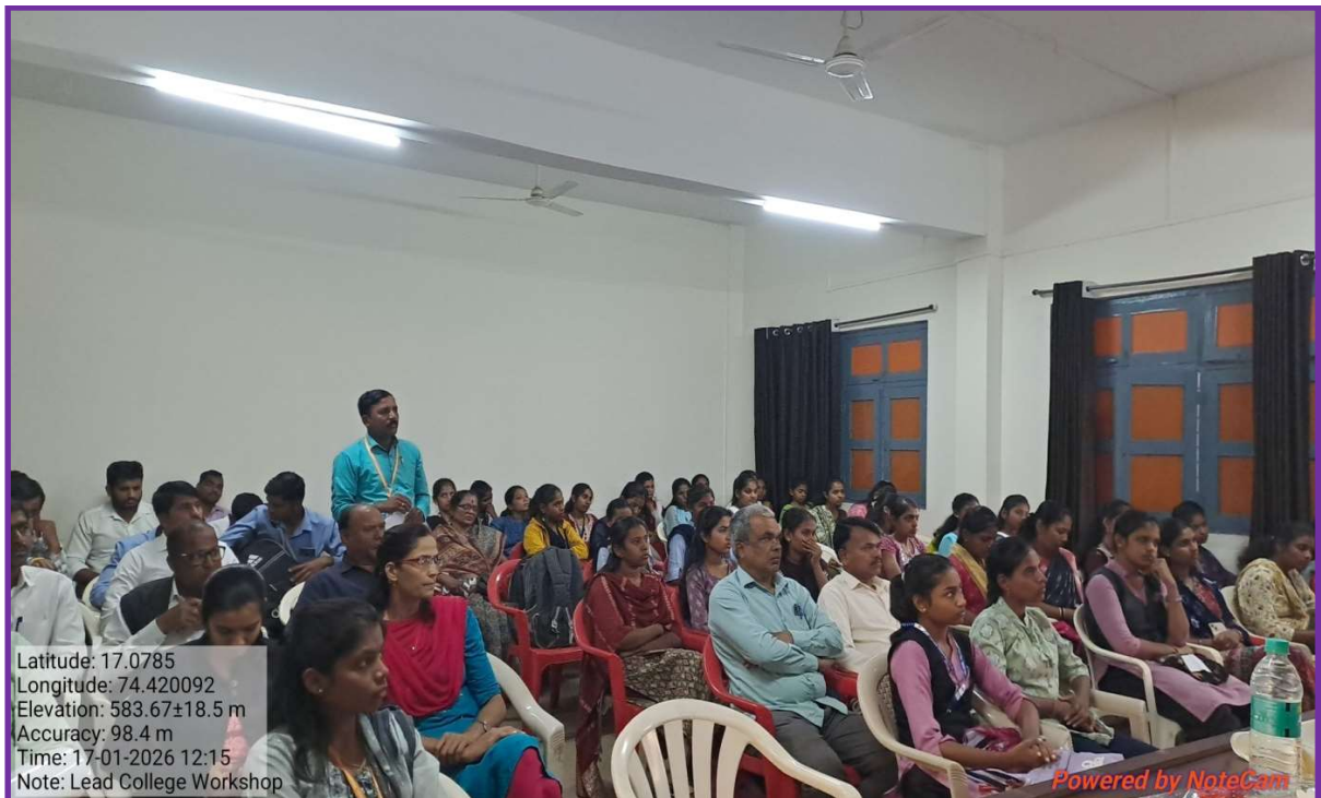
Audience of the Workshop