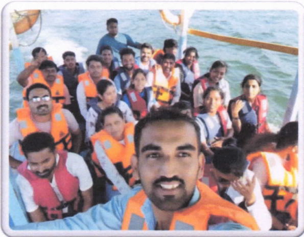
While Going to Sindhudurg Fort