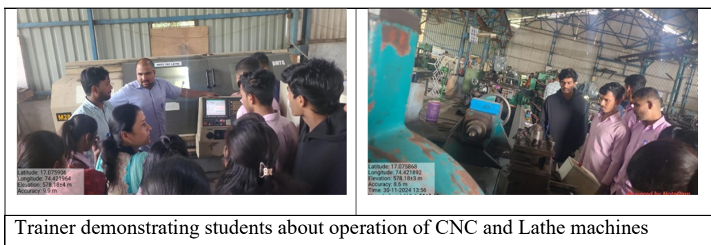
Trainer demonstrating students about operation of CNC and Lathe machines