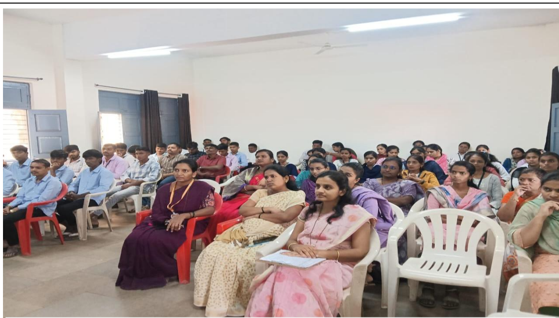
1 st December, 2025 World Aids Day : Students and Teaching Staff