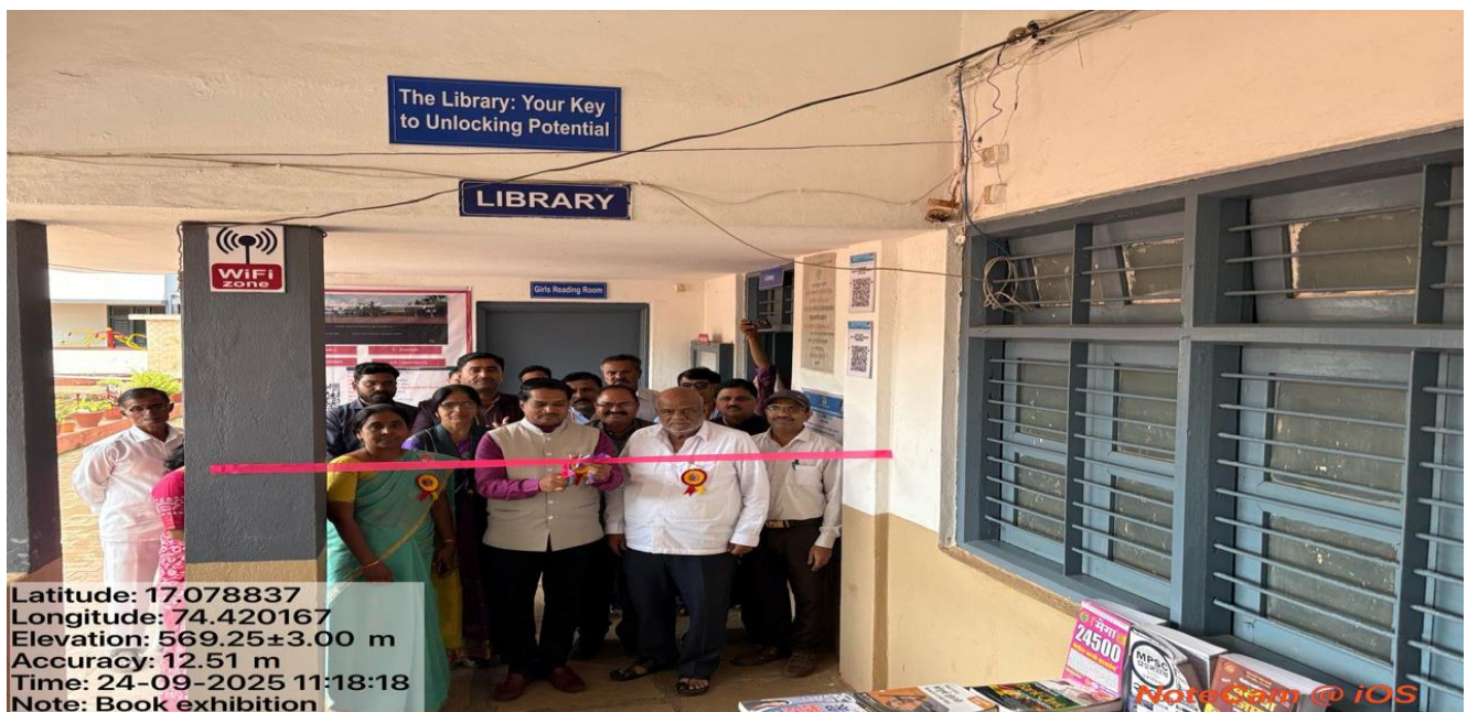
Inauguration of Book Exhibition