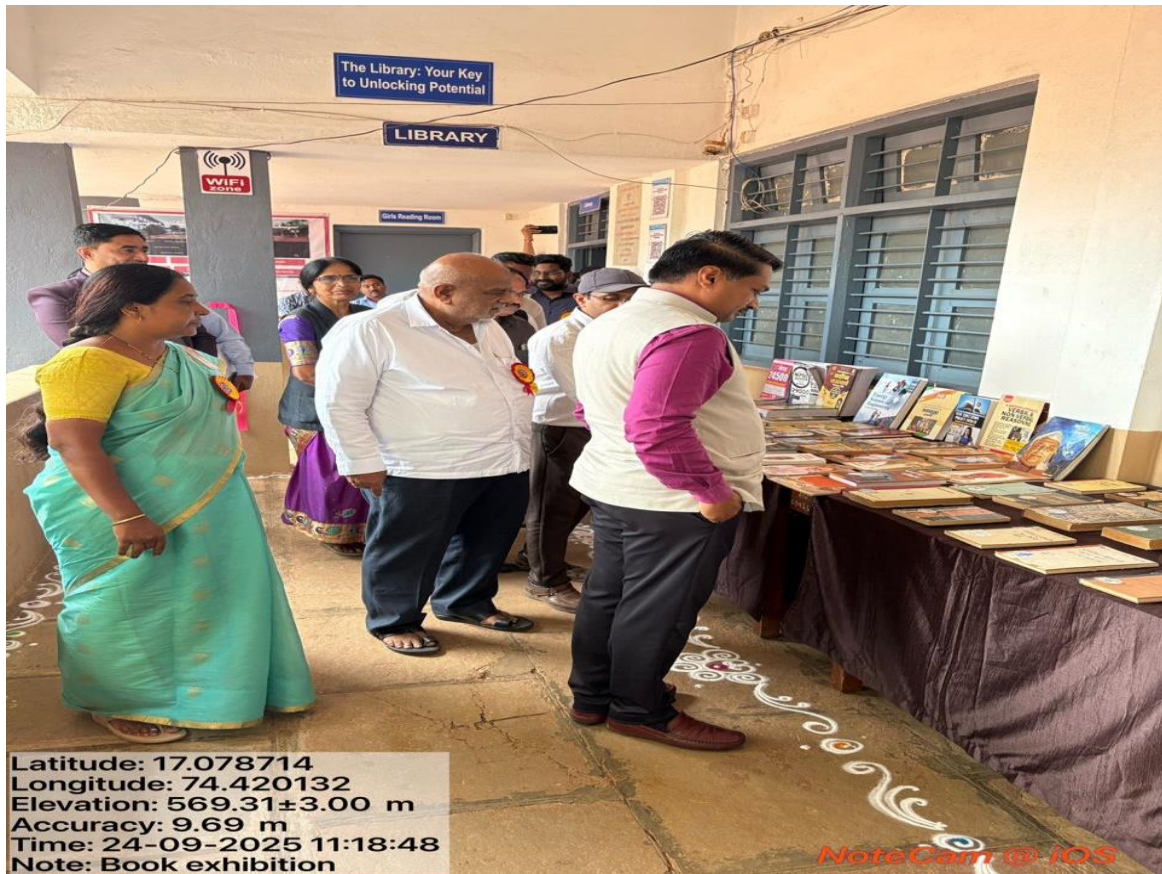
Dignitary Viewing Exhibition