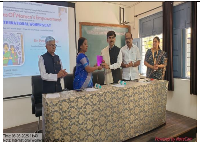
Felicitation of chief guest