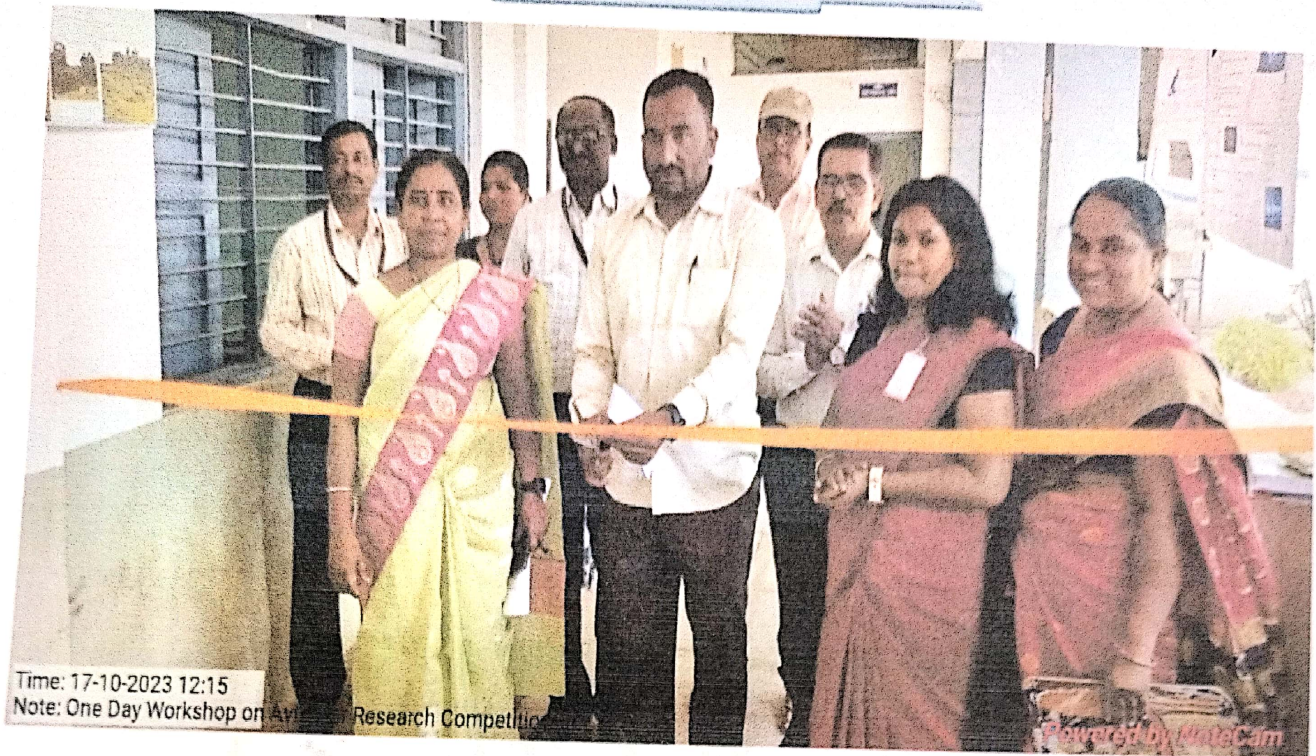
Inauguration of the Competition with the all Dignitaries