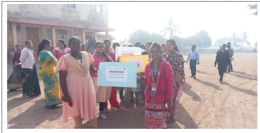
B. Sc. II students actively participated in Organ Donation Rally