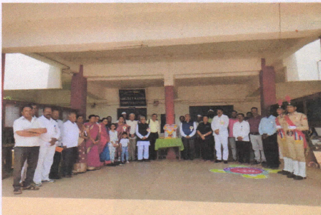
Dignitary while worshipping the image