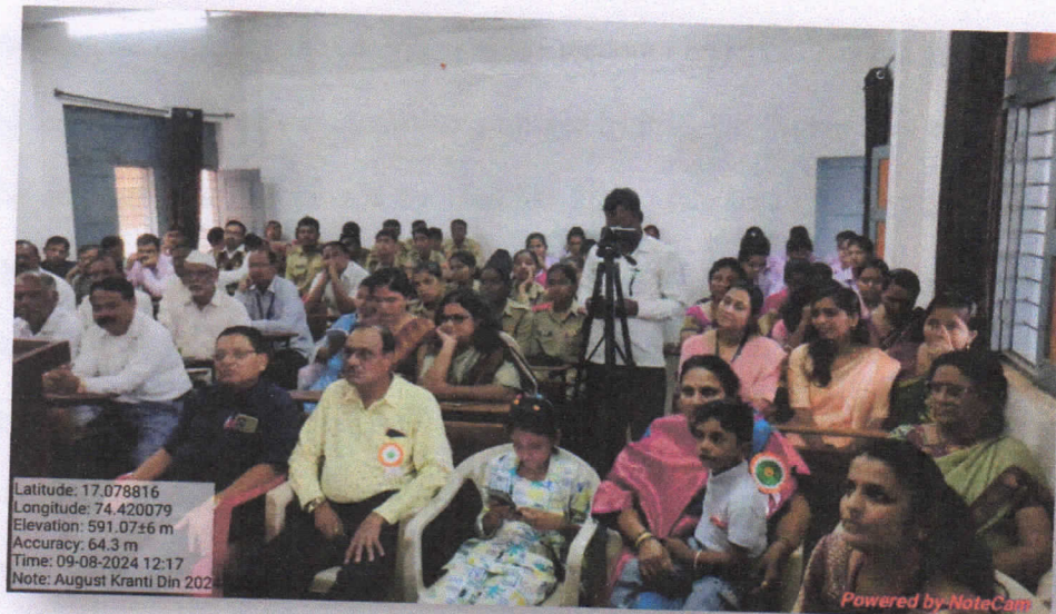
Professors and students present