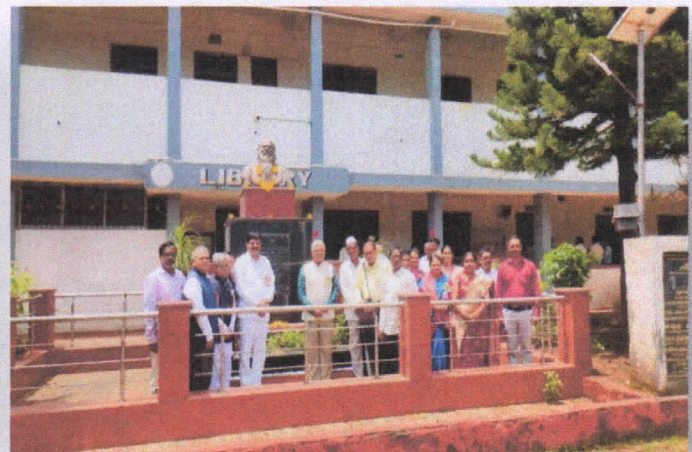
Honorable while worshipping Karmaveer Bhaurao Patil Statue