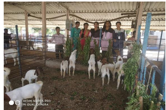
Students of B. Sc. visit to Sisal goat farm at Gondilwadi (Palus)