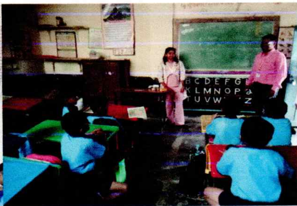
Faculties and Headmistress of the School are interacting with the students.