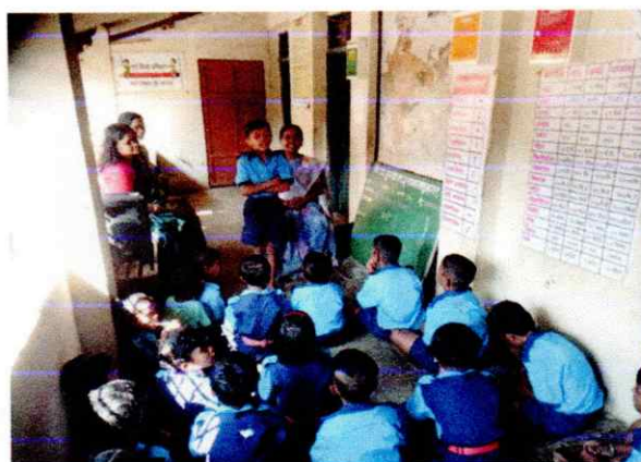
The Faculties Department of English is interacting with the students.