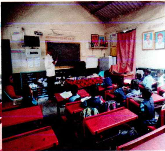
Faculties and Headmistress of the School are interacting with the students.