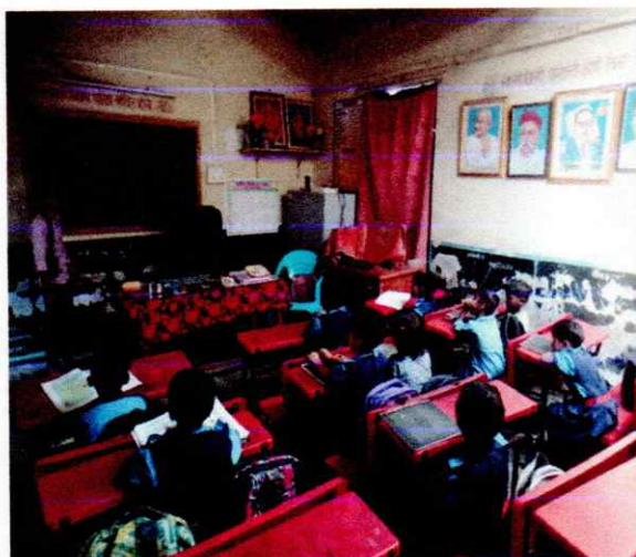
The Faculties Department of English is interacting with the students.