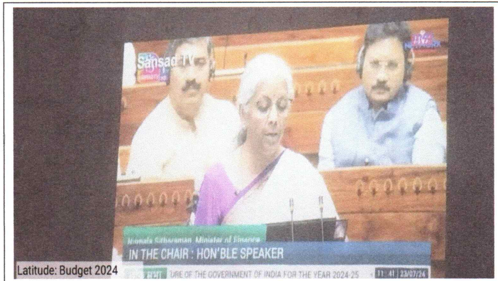
Finance the budget bil in Indian Parliament Minister Mrs. Nirmala Sitharaman is presenting