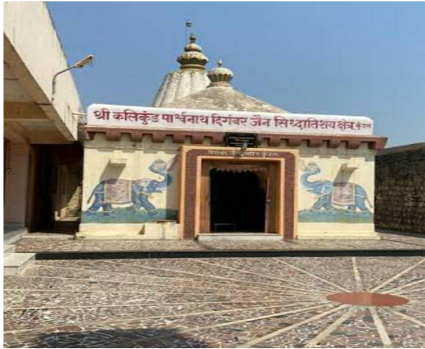
Old Digambar Parshwanath Jain temple