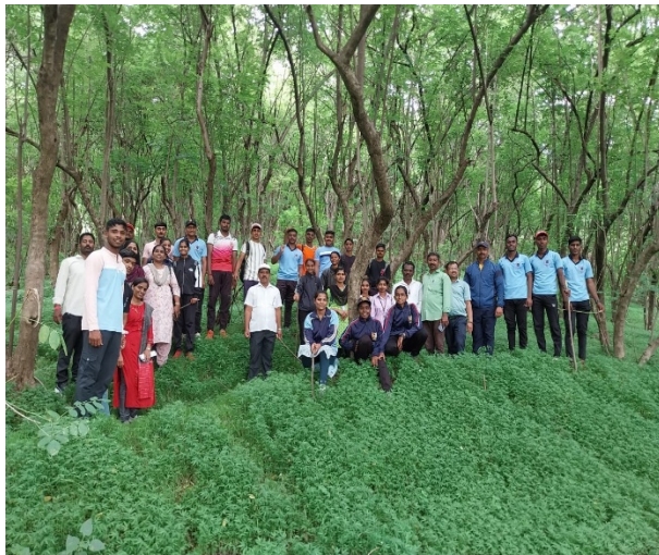
Teachers & Students enjoying nature While Trekking