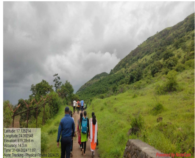
Students While Trekking

[Signature] Head of Department Department of Geography Dr. Patangrao Kadam Mahavidyalaya, Ramanandnagar (Burli)