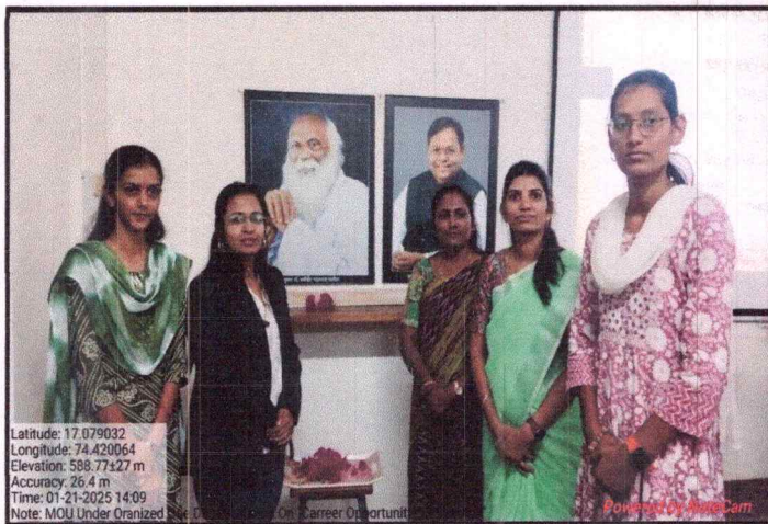
The Inauguration was done by dignitaries