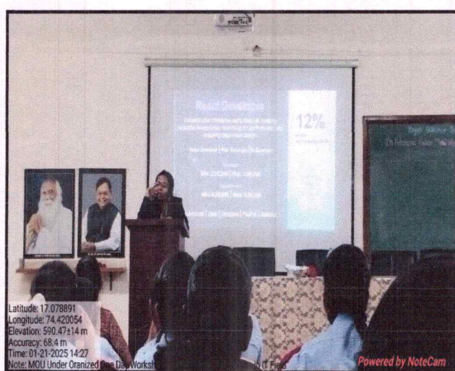
Students attend guest lecture.

Dr. Patangrao Kadam Head of Dept. Department of BCA Dr. Patangrao Kadam Mahavidyalaya, Ramanandnagar (Burli)