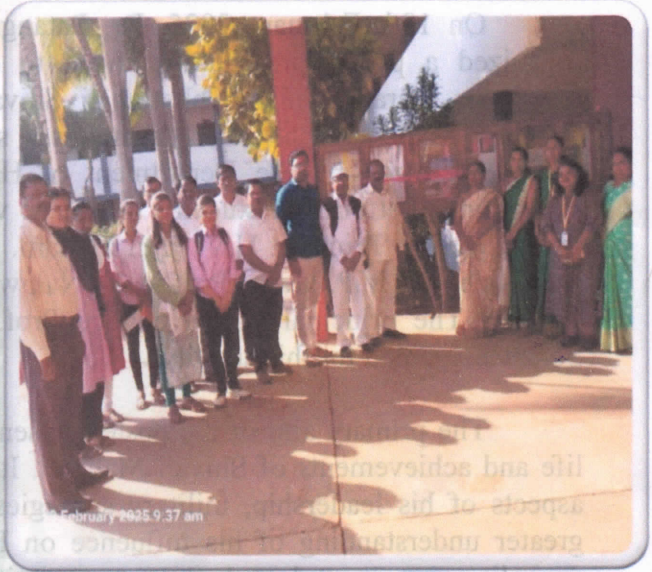
On the occasion of Shiv Jayanti Poster Presentation along with Principal, professors and students of History Department