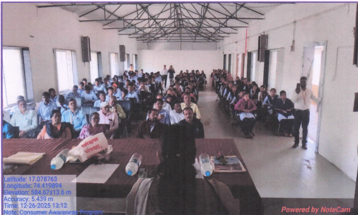
Audience of the Program

Head, Head, Department of Economics Dr. Patangrao Kadam Mahavidyalaya, Ramanandnagar (Burli)